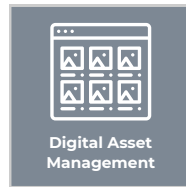
Digital Asset Management

Use Product Approvals to onboard licensees, share brand assets, review submissions, manage approvals, assign SKUs, and ensure compliance and quality control.